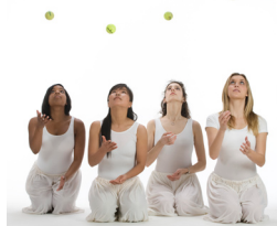
Above: The Tennis Dances.