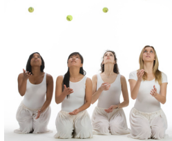
Above: The Tennis Dances.